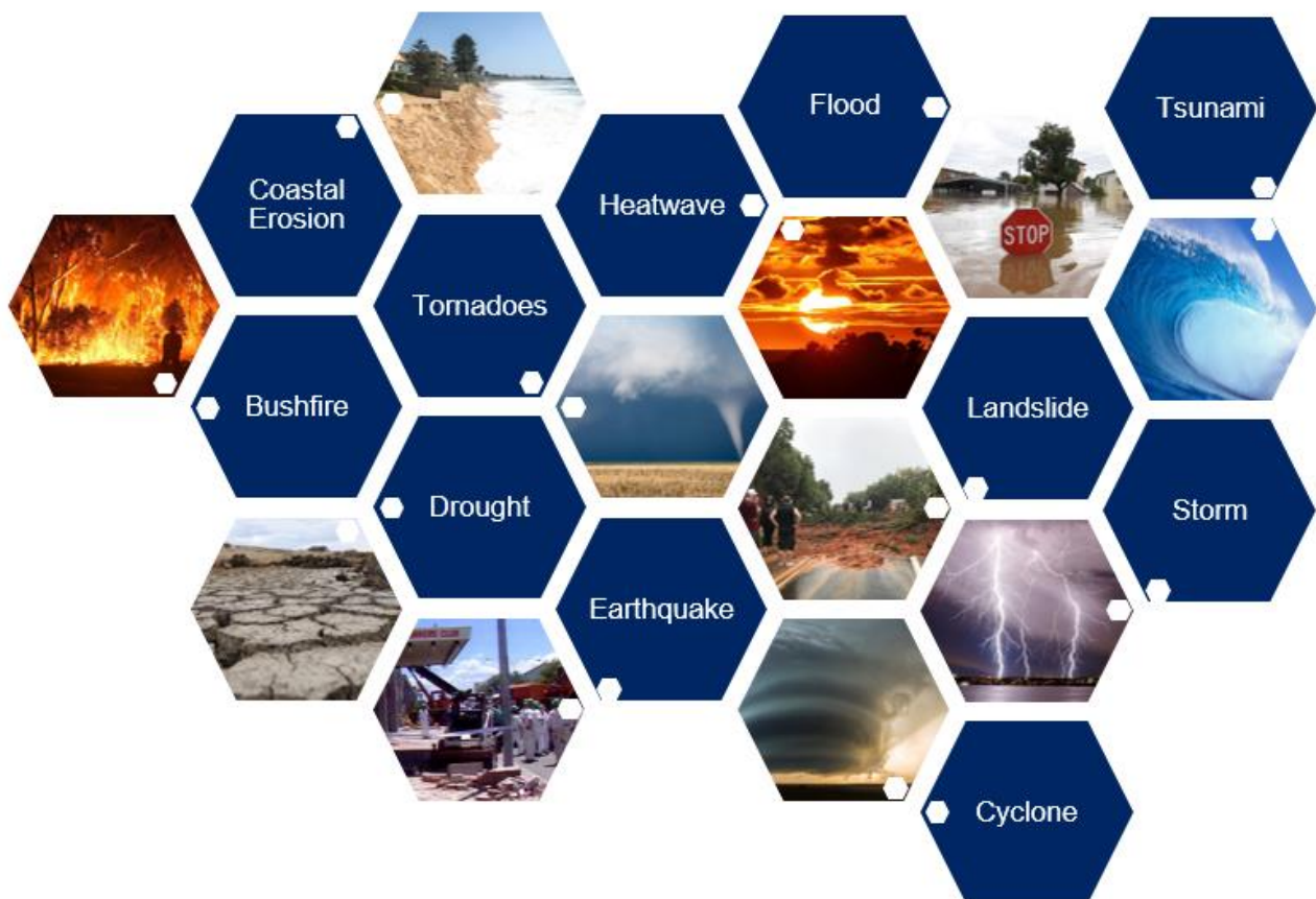
Figure 2. Shows the natural hazards that are included in the Guide

The Strategic Guide to Planning for Natural Hazards covers natural hazards identified as posing a high or extreme risk to NSW 1 . It also covers natural hazards that are considered to pose a risk due to the effects of climate change. Figure 2 shows a graphic of the risks considered.