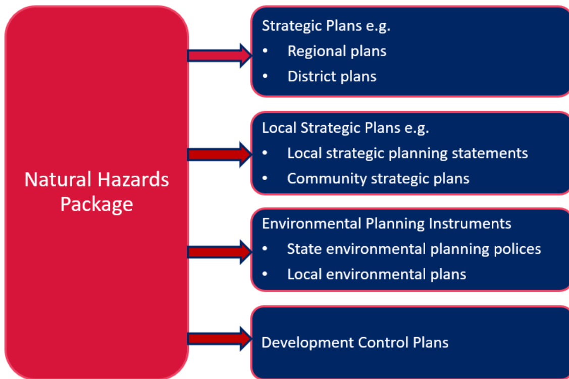
Figure 1. The Natural Hazard Package and the NSW Planning Framework

A resource kit has been developed to help planning authorities find the natural hazard information they need. Figure 1 outlines where the guide and resource kit (which together are known as the Natural Hazards Package) fit into the planning framework.